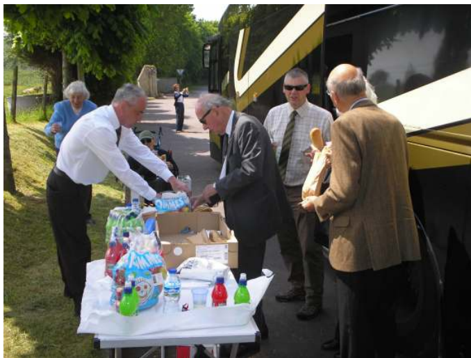
Lunch at Audrieu