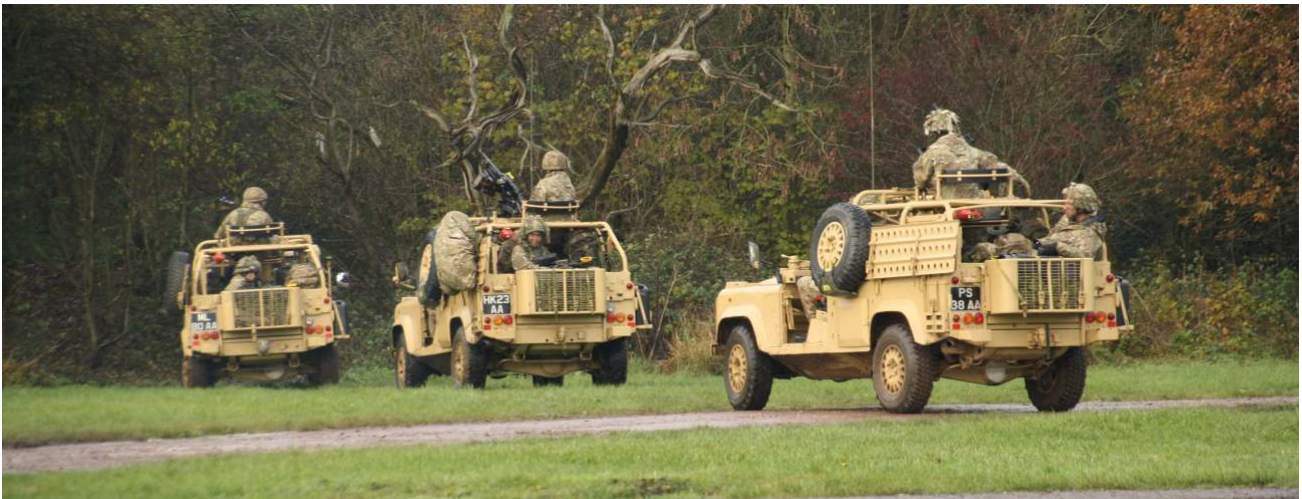
RWIMIK on patrol

As we look forward to this year I hope that my next article for the newsletter will announce that we deployed a full RWIMIK light cavalry squadron on ATP. In addition, after a year of rolled-up sleeve hard work, I hope to be able to report the Squadron as having had a lot more fun not just “on the field” but off it as well. If we achieve our target on ATP and also recruit the Squadron up to 100% then the we will have a huge amount to be proud of. We are not there yet but this year has been an excellent start.