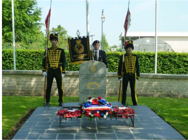
The SRY memorial

. In the afternoon, we attended ceremonies at Hottot, where we were favoured with an appearance by the local “Scottish” pipe band, and at St Pierre and Tilly where the day ended with cider and a chance to visit the Tilly Museum. We are always warmly welcomed at Bayeux and Tilly and, once again, we are grateful to all our French friends for their hospitality and assistance with our ceremonies.