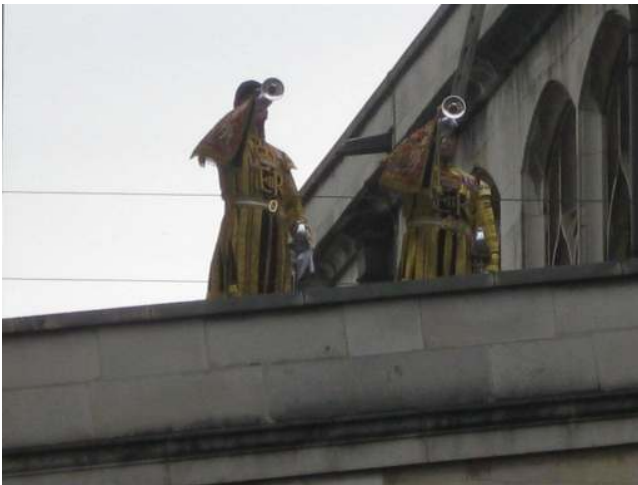
State Trumpeters on the roof