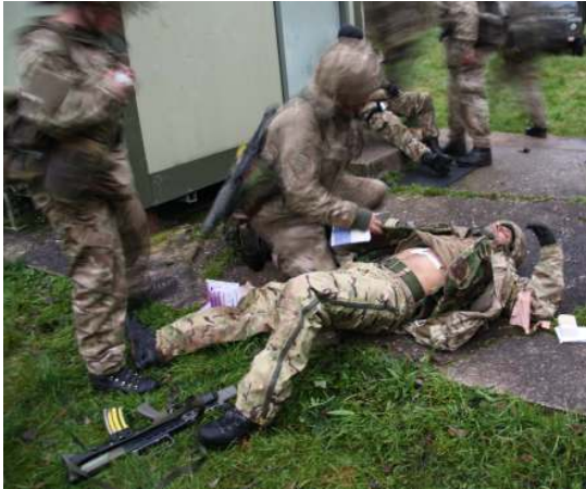
First Aid training