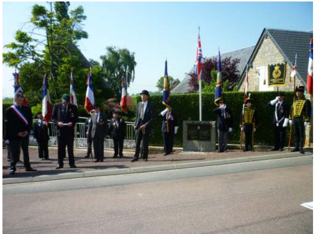
At the SRY memorial at St Pierre Farm