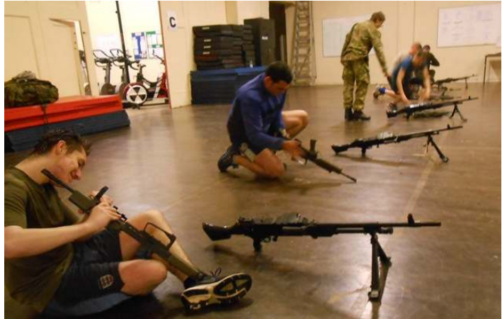
Weapon Training at Carlton