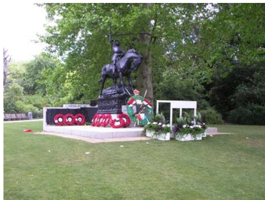
The Cavalry Memorial, Hyde Park

This year the Cavalry Memorial Parade will be held on Sunday 11 th May in Hyde Park and I hope that the Regiment will again be well represented. Detailed arrangements will be co-ordinated through the Midlands Branch so, if you would like to attend, please contact the Branch Secretary. I assume that the RY will, as usual, be organising a lunch after the parade. This year the lunch will be held at The Rifles Club, cost £17-50 per head. If you would like to attend, please let me know as soon as possible.