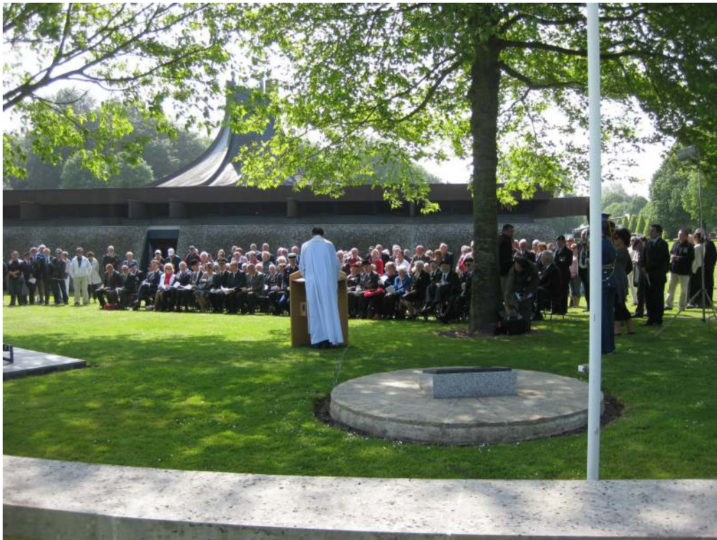
The service at the regimental memorials at Bayeux Museum