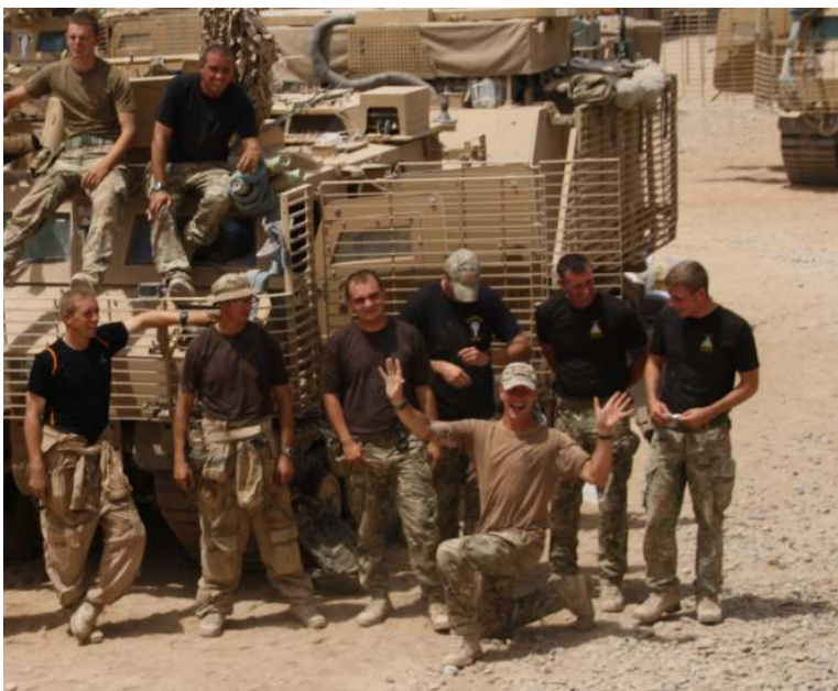
RY (including SRY) members in Afghanistan

It has now been ten years since I deployed to Iraq as part of a substantial number from the Squadron. Whilst the nature of operations and deployment has varied hugely over that time, one thing has remained the same the squadron has met the call for IRs (individual replacements) to back fill regular regiments every time without fail. Once again, we have welcomed five soldiers back from Afghanistan where their performance was superb. Two of them attended the Sun Military awards with a soldier from HQ Sqn who won an award for his actions in an incident in which all three of them were involved. Even though the nature of operations is changing, I have no doubt we will be a permanent fixture in future operations working hand in hand with our regular counterparts in various of areas of the world as yet unknown.