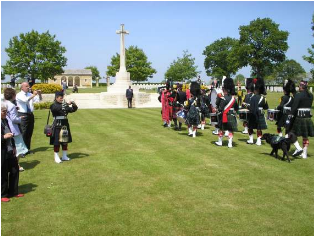
The Pipes and Drums at Hottot

. In the afternoon, we attended ceremonies at Hottot, where we were favoured with an appearance by the local “Scottish” pipe band, and at St Pierre and Tilly where the day ended with cider and a chance to visit the Tilly Museum. We are always warmly welcomed at Bayeux and Tilly and, once again, we are grateful to all our French friends for their hospitality and assistance with our ceremonies.