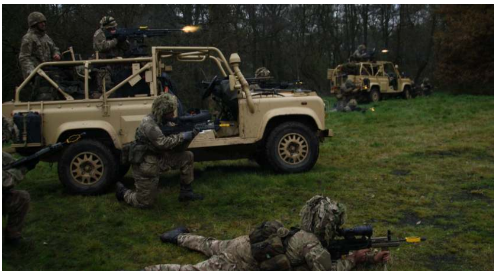
RWIMIK in action

We are well on the way to achieving a full conversion to a RWIMIK light cavalry squadron by the target date of October 2014 and I would like to thank the soldiers and NCOs for their hard work and dogged attitude in qualifying as RWIMIK crews. When the full Squadron rolls out at Camp this year it will be an impressive sight.